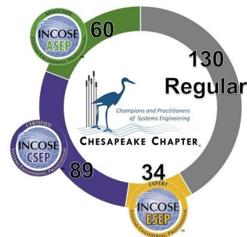
April 2019 INCOSE-CC Membership Breakdown 313 Total Members

Consider advertising your openings by being part of an email campaign as well as a web site announcement. We have over 1200 contacts on our mailing list. Contact us at membership@incose-cc.org